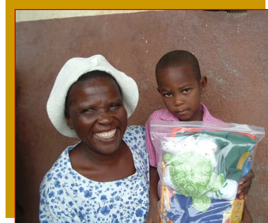
GSM took "glad tidings of great joy" to over 2100 Haitian children through our Christmas Bag ministry - "The Hope of Christmas".

changing children - changing a nation - one heart at a time