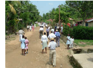
▼ Church members going home after services