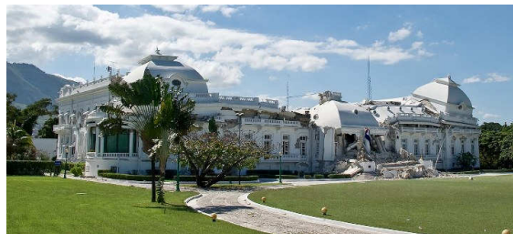
▲ Many Haitian Christians view the collapsed Presidential Palace as a sign of God's judgment on the corrupt government.

In Haiti, 2010 will be remembered for generations to come as the year of the Great Earthquake. But more importantly, we are praying that 2010 will be remembered for eternity as the year in which a nation turned from her sorceries and corruption to embrace the redeemer of souls and nations - our Lord and Savior Jesus Christ. The Haitian Christians are also embracing this hope. They believe the earthquake to be a sign from God that it is time for the nation to repent. There is a sense of expectation that God is doing a great work in this country. Indeed, churches are not only full on Sundays, but Haitian Christians are in their churches seven days a week offering prayers and supplications for their country - and tens of thousands are coming to Christ. We are expecting that the Great Earthquake of 2010 is producing a Tsunami of a different kind - a tsunami of God's Holy Spirit sweeping across the nation! We are praying that 2010 will be the year that Haiti breaks free from the spiritual bondage that has gripped this nation for over 200 years!