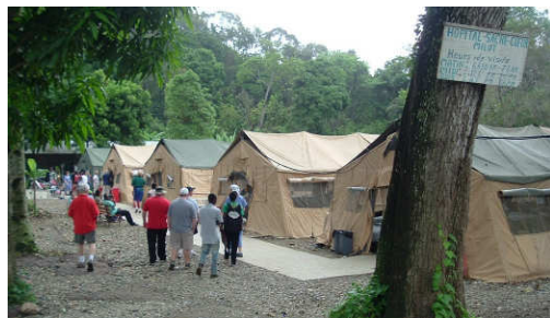
▼ the tent hospital at Milot