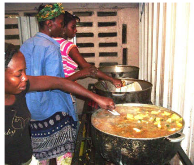
◀ Haitian Christians preparing food in GSM's cafeteria, for the tent hospital in Milot.